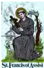
St. Francis of Assisi