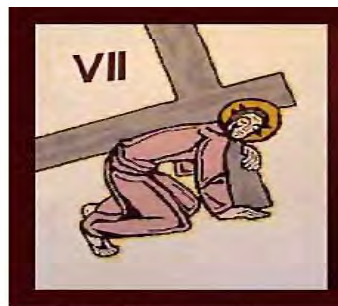
Jesus falls a second time.