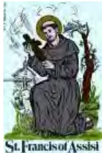
St. Francis of Assisi