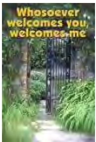
Whoever welcomes you, welcomes me